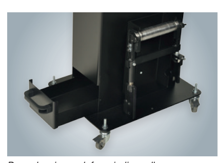
Base showing rack for grinding rollers and the integrated spark/chip box.

Pipe Notcher complete with built-in dust extraction system.