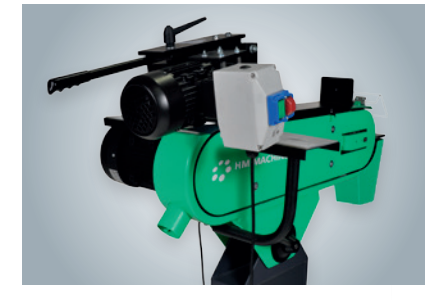
HM TAS 75CG / CGX Grinding and Polishing of tubes, Ø 20 - 100 mm

With a 2-speed motor and wet cooling system. Grinding and Polishing of tubes, Ø 6 - 100 mm