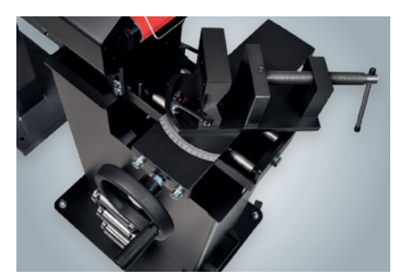
Vise for pipe and tubes with angle adjustment up to 60°.